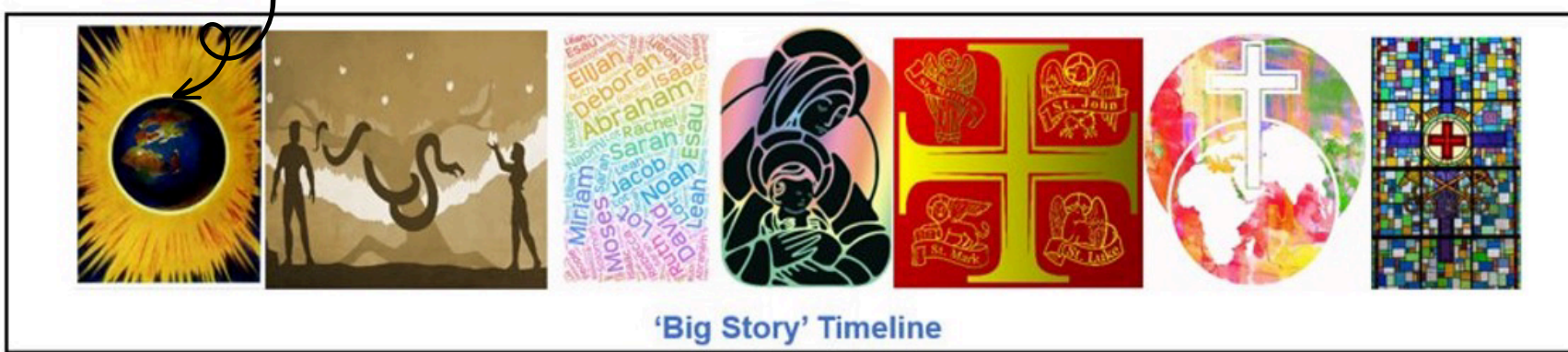
'Big Story' Timeline

Creation is at the beginning of the Big Story of the Bible